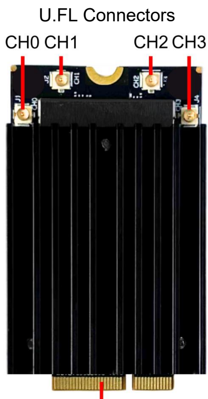
M.2 E Key Interface with PCIe 3.0